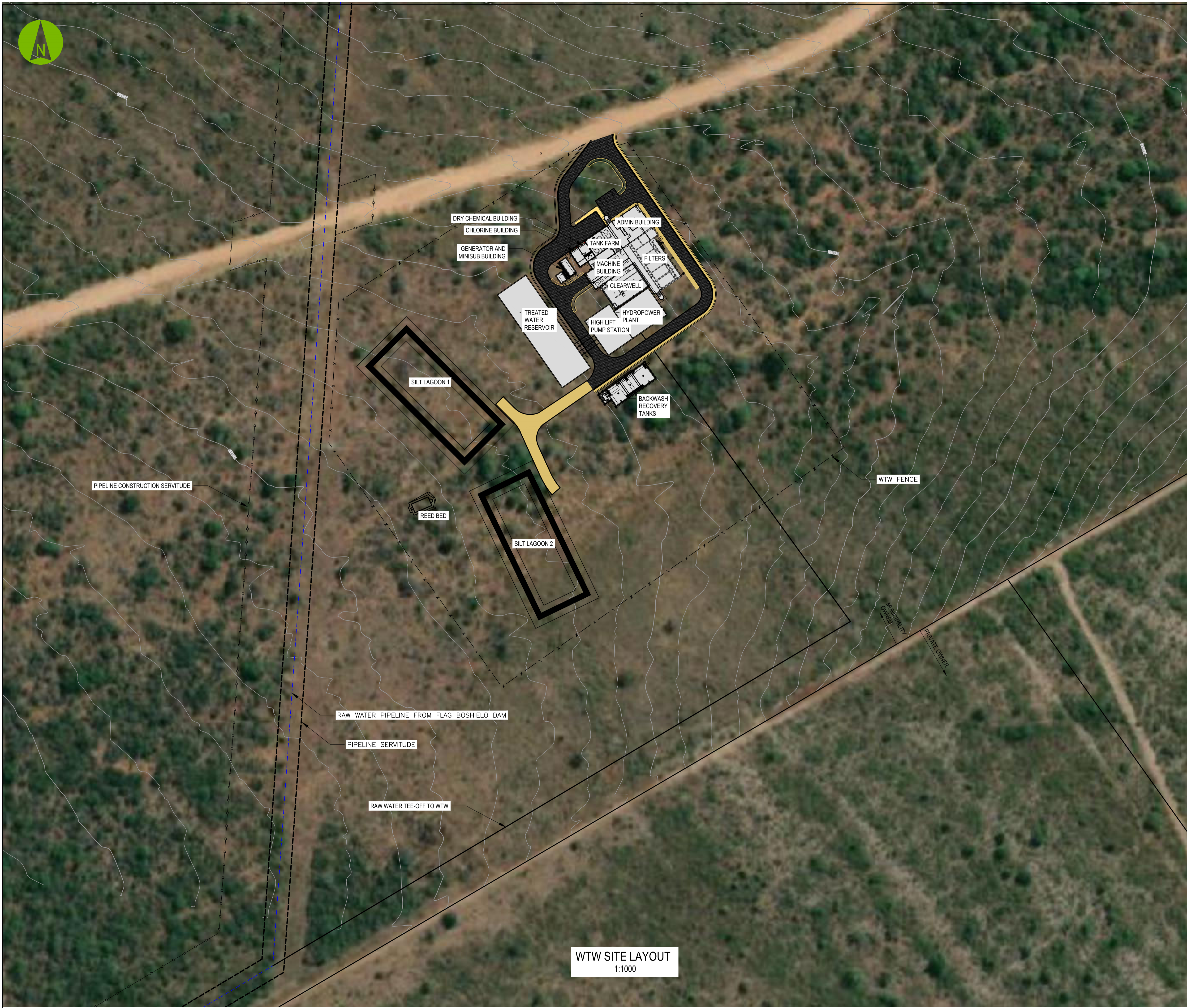
WTW SITE LAYOUT 1:1000

NOTES : 1. FOR SETTING OUT DETAILS REFER TO DRG 111605-0001-DRG-CC-0300 2. FOR PHASING AND DRAWING SETS REFERENCE PLAN REFER TO DRG 111605-0001-DRG-CC-0103 3. FOR STRUCTURAL DRAWINGS REFER TO RANGE 111605-0001-DRG-CC-2000-3000 4. CONTOURS REFERENCE NATURAL GROUND LEVELS.